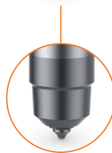
DEF – open nozzle with straight outlet version C Antechamber version A