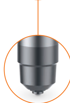
DEF – open nozzle with straight outlet version A Antechamber version C