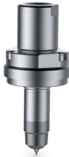
SEF – open nozzle with tip version "Tip" Antechamber version A