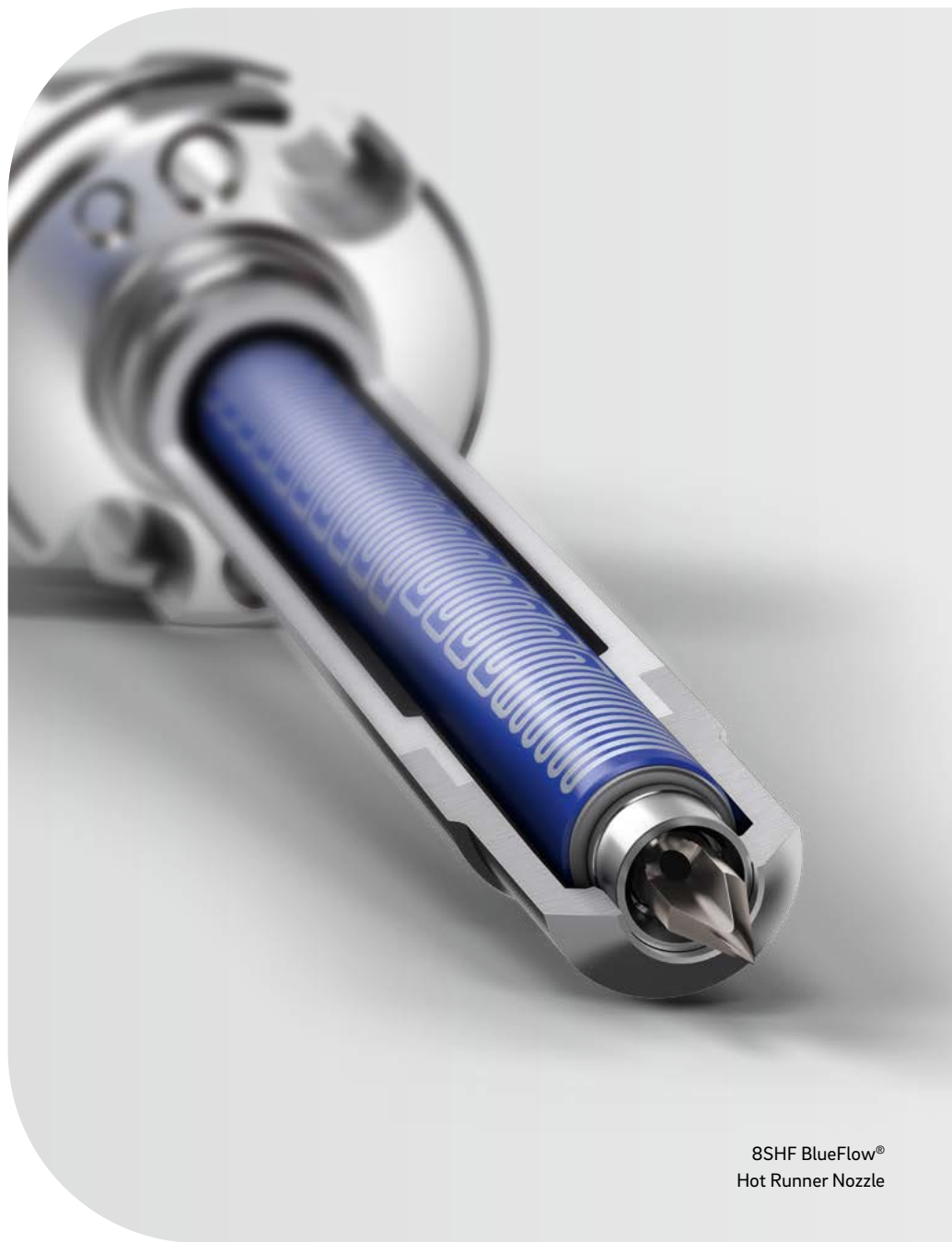
8SHF BlueFlow® Hot Runner Nozzle