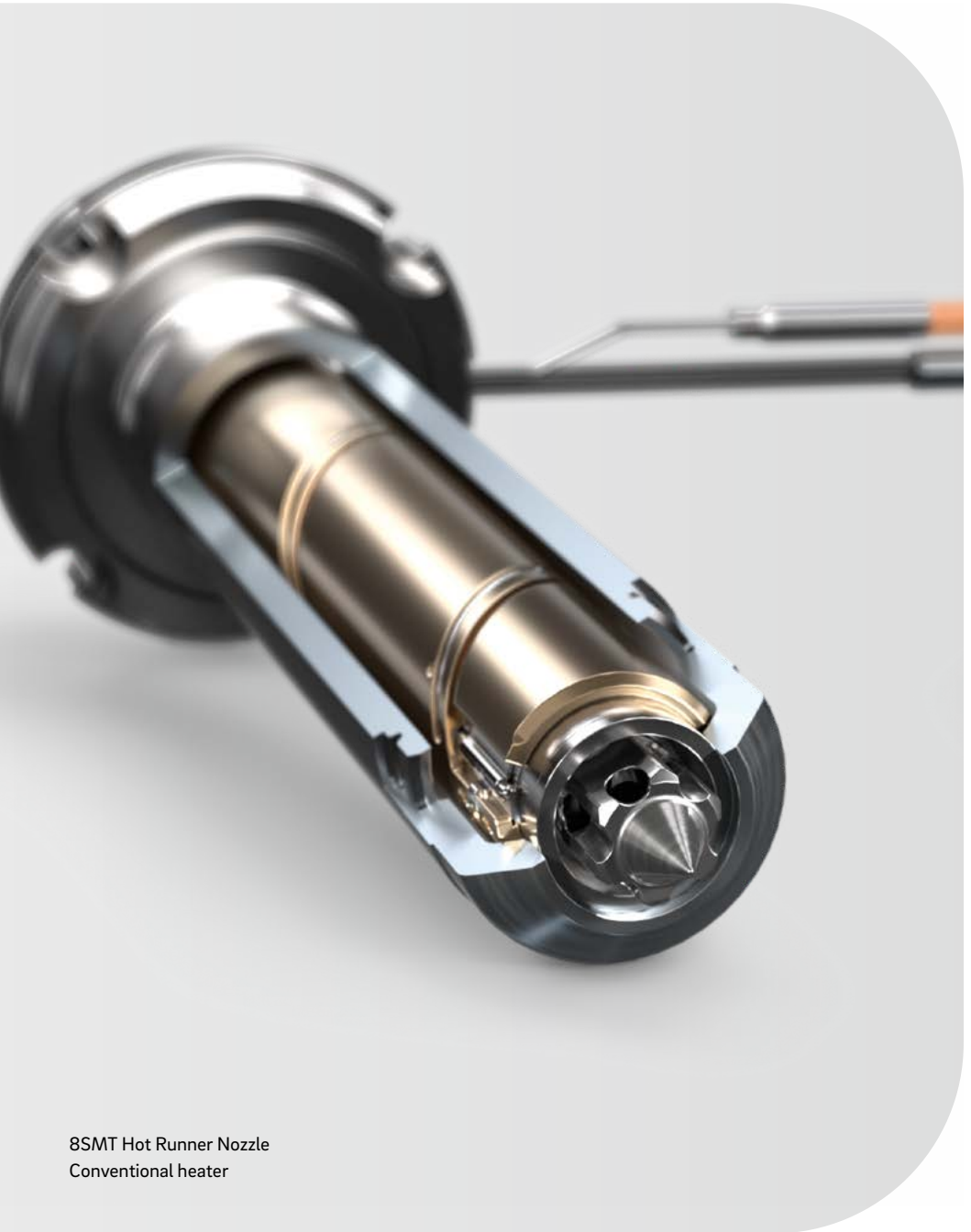
8SMT Hot Runner Nozzle Conventional heater